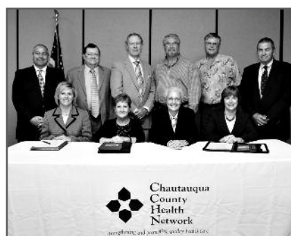
Chautauqua County Health Network Board of Directors

CCHN continues to define and shape the future of the local health care delivery system through program development, tracking and evaluation, education, and advocacy. We provide leadership in achieving creative solutions to community needs and promoting collaboration among those who have a stake in improving our health care system.